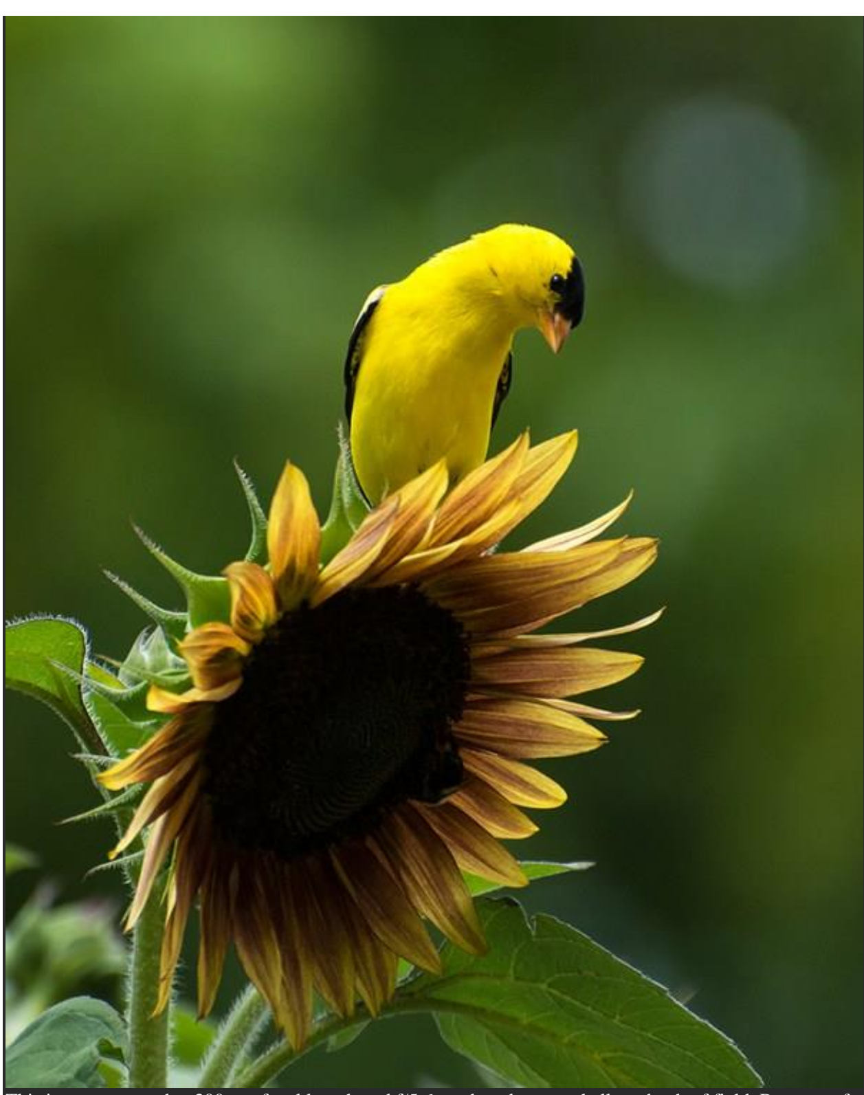
This image captured at 300mm focal length and f/5.6 produced a very shallow depth of field. Because of this, it is important to set your focal point on the subject's eye. Notice how the bird pops out from the background.

When should I use deeper depth of field?