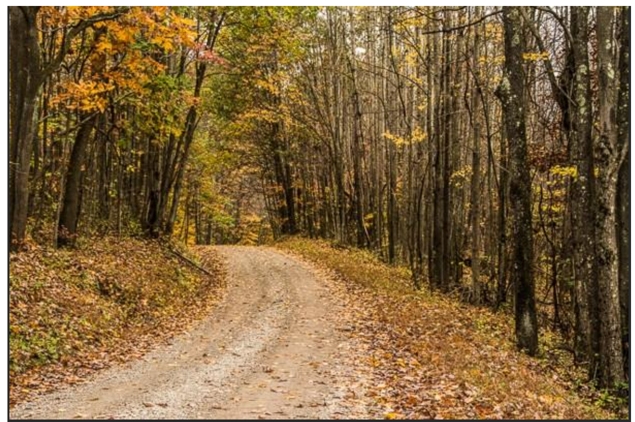
This landscape was captured with a 50mm focal length at f/16. The focus point was set at 8 meters, which made everything from 4 meters to infinity in focus.

In <u>landscape photography</u> it is important to get as much of your scene in focus as possible. By using a wide angle lens and a small aperture you will be able maximize your depth of field to get your scene in focus.