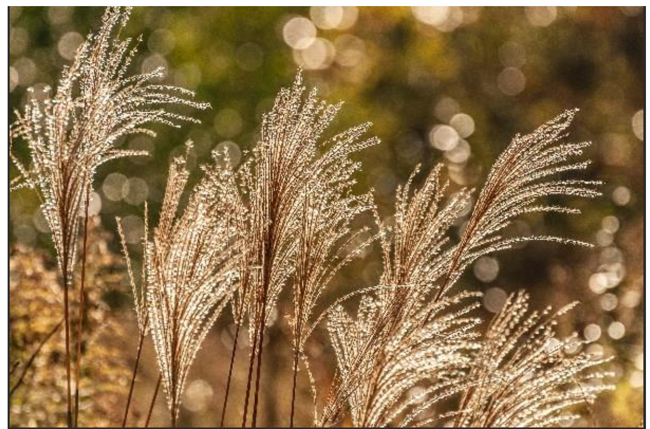
Bokeh in this image was created by the distance of the subject to the background, which fell well beyond the depth of field.